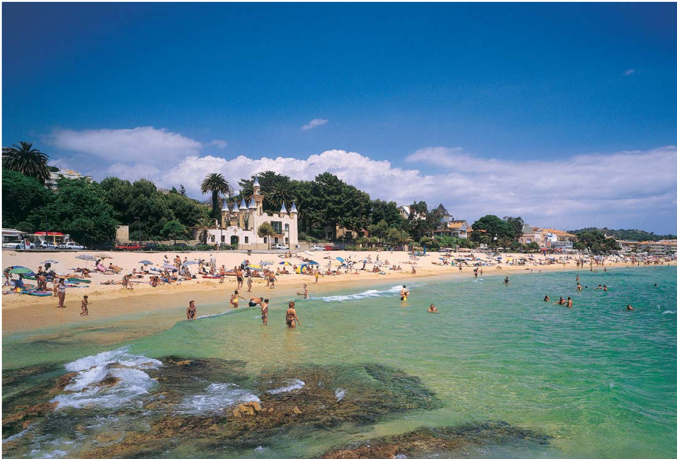
SANT POL BEACH