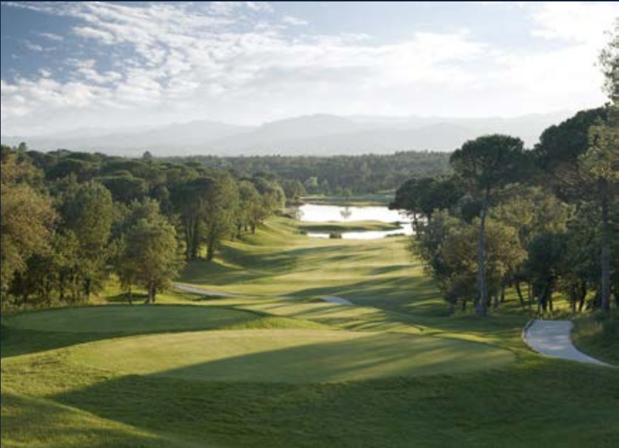
PGA GOLF & RESORT