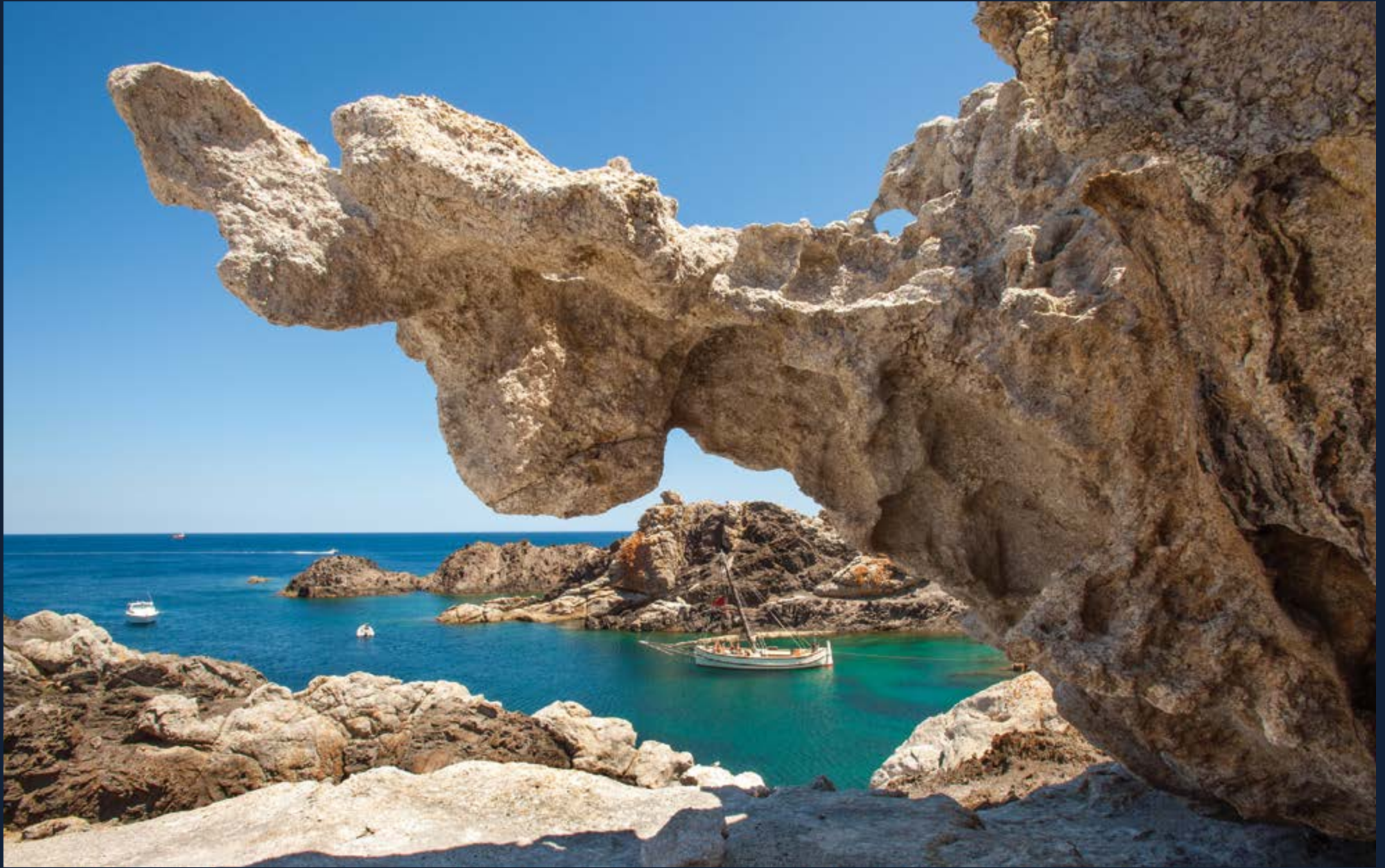
CALA CULLARÓ, CAP DE CREUS