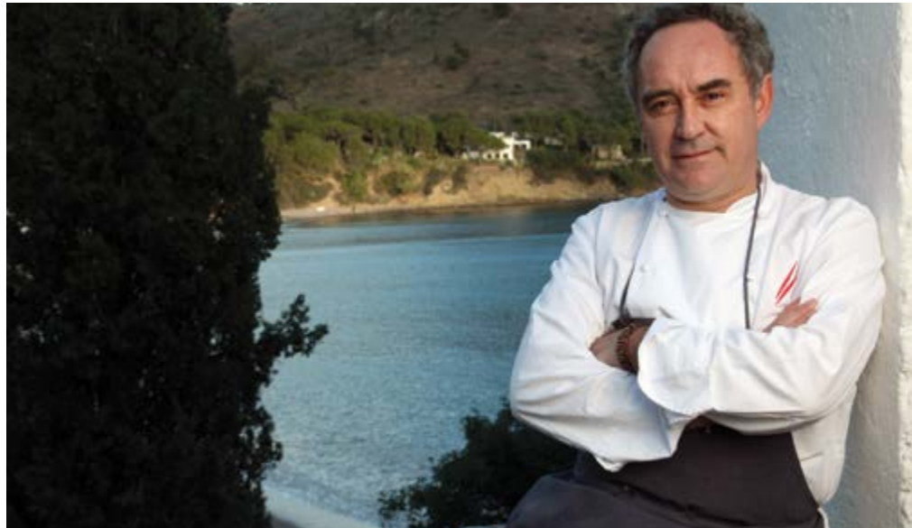
EL BULLI FOUNDATION

We invite you to find your way around a town full of delights and new sensations awaiting your discovery, as did the earliest settlers over 3,000 years ago; a place in which the enjoyment of nature, culture and traditions is a privilege available to everyone.