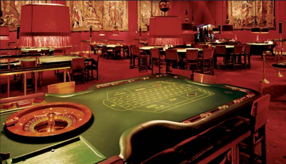
PERELADA CASTLE CASINO