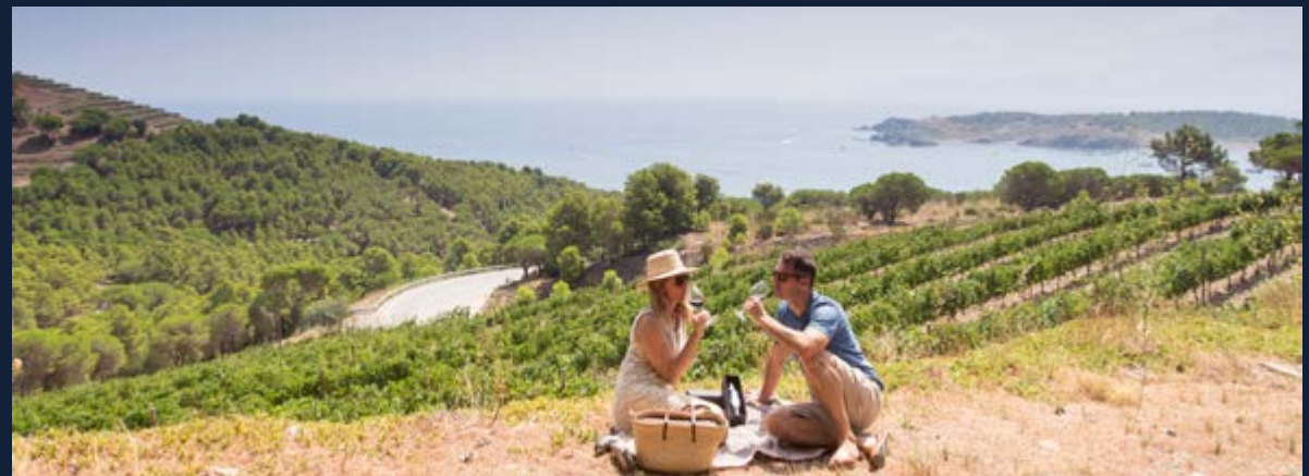
FINCA GARBET, GRUP PERALADA

There are few places in the world that are home to so many scenic treasures, charming villages, and cultural attractions as this corner of the Mediterranean.