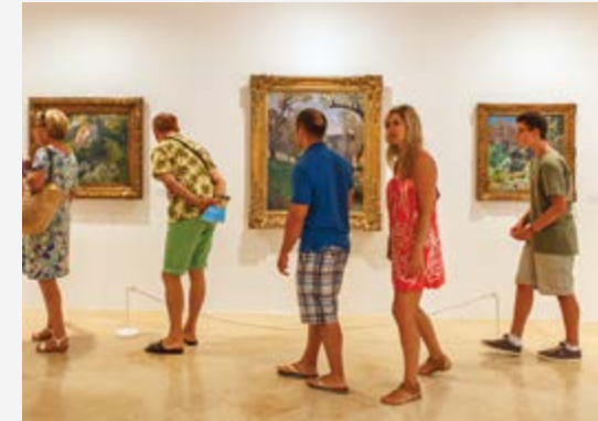
CARMEN THYSSEN SPACE