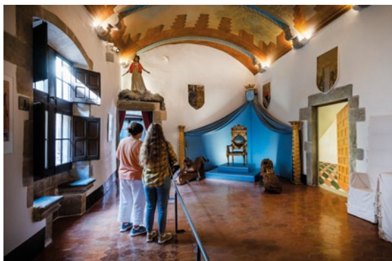
Castell Gala Dalí, Púbol

The work of Salvador Dalí cannot be understood without discovering the Empordà, his native land. The "Dalinian Triangle" traces an exciting itinerary through three essential museums that will transport you to the world of the master of surrealism. salvador-dali.org