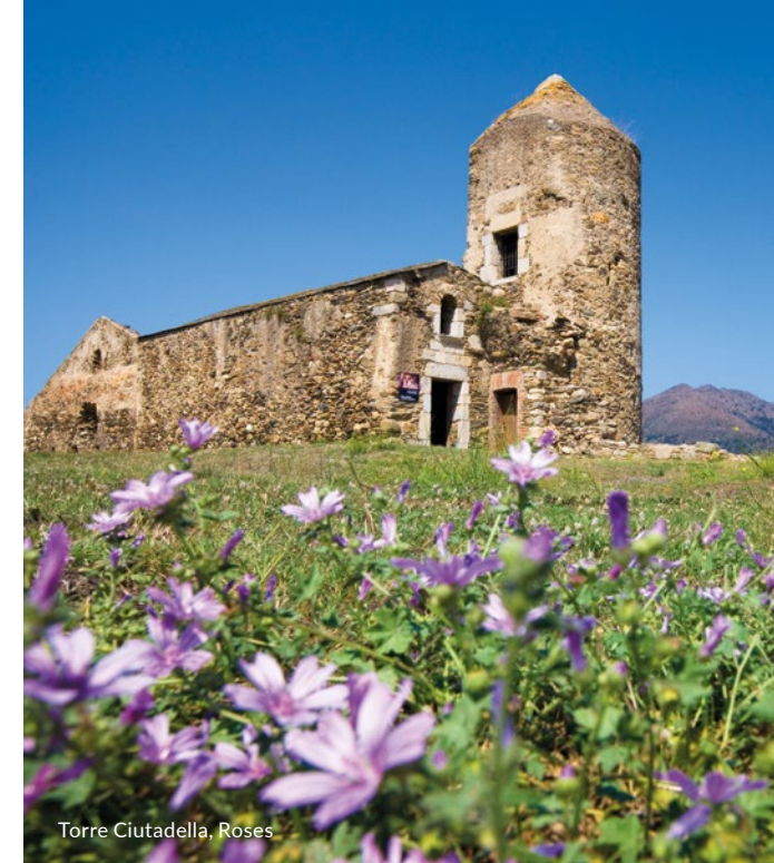
Torre Ciutadella, Roses

A tour through a place of extraordinary beauty where the most important milestones in the history of El Bulli are on display. El Bulli is the place that changed the paradigm of world gastronomy thanks to Ferran Adrià. Take a walk through the history of the old El Bulli restaurant guided by one of its creators and discover what it has become: a source of knowledge and innovation. elbullifoundation.com