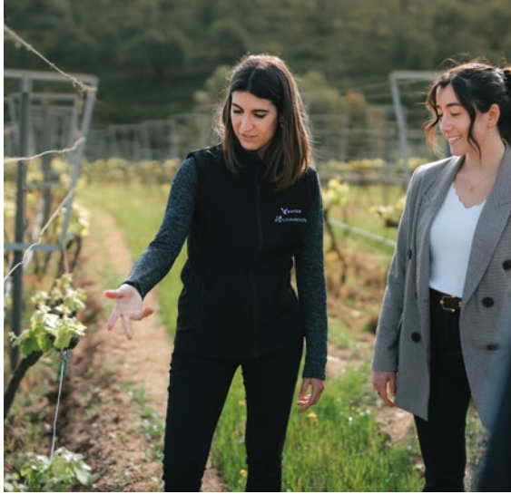
Celler Olivardots, Capmany