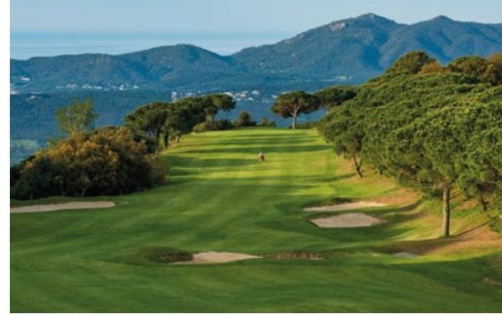
Golf d'Aro, Platja d'Aro i S'Agaró