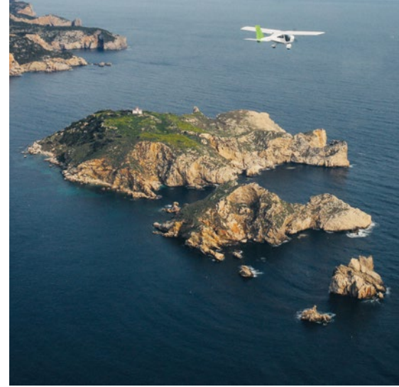
Illes Medes, Torroella de Montgrí