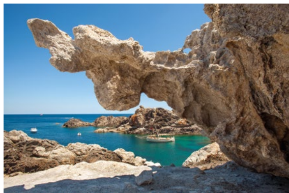
Cap de Creus

Through interpretative panels located on the main beaches/sites of Llança, we will discover the different fishing gear that were used in the past.